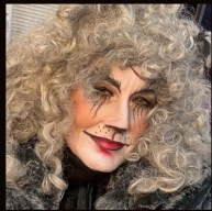
COCO MASE June 21 st @7pm