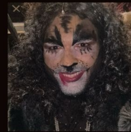
JOJO June 22 nd @3pm