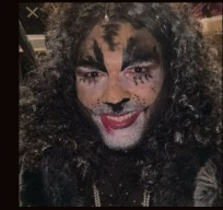
JOJO June 22 nd @ 3 pm