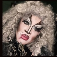
BLACK CHERRY LOVEE* June 15 th @3pm